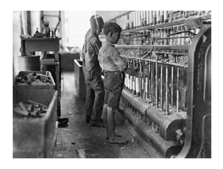
"They have to be constantly watched," said the employers' newspaper, Textile World, "or they will go from bad to worse in order to make more time for play"